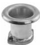
45 DCOE, 75mm Part No. ITG-FR45-75