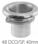
48 DCO/SP, 40mm Part No. ITG-FR48-SP