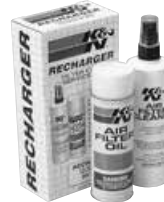
Filter Care Kit Part No. 3850